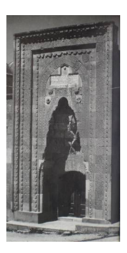
Figure 2. Portal of Alaaddin Mosque, Nigde, 1223 (Source: Akurgal, E., 1980, The Art and Architecture of Turkey, Rizzoli, New York, p. 106)

At this point it would be appropriate to elucidate the etymological roots of the terminology in regard to its relation with Turkish art. As a matter of fact, the word "arabesque" has entered to the language of Turkish long before the Republican era, and was defined as 'Arabian style of decoration, a complex and bizarre fusion of various decoration elements'. An ambiguity of definition is observed in