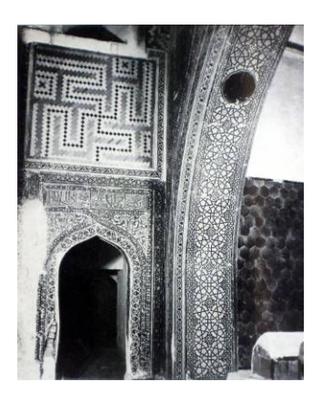
Figure 4. Grand arch and door in Mousoleum of Sahib Ata, Konya, 1258-83 (Source: Aslanapa, O., 1971, Turkish Art and Architecture, Praeger Publishers. New York and Washington. p. 274)

In regard to the morphology of Islamic art, geometrical nature of arabesque is emphasized<sup>37</sup> in a series of studies. The geometrical richness of Islamic art which stems from the blend of organic and geometric, subjective and objective conception of nature through the interplay of illusion, function and dynamic interlacing<sup>38</sup> is elucidated by means of the analysis of the visual language of arabesque<sup>39</sup> in terms of its relation to numerology and semiology. Within the scope of shape grammar studies, which analyse the underlying grammatical structure behind the shapes<sup>40</sup> and their relation to socio-economical and socio-political contexts<sup>41</sup>, Islamic art has been the focus of various studies that intend to derive generic models<sup>42</sup> for their underlying geometrical logic<sup>43</sup>. All these studies reveal the underlying structure of arabesque ornamentation as a complex system accomplished through successive combinations of simple forms in very similar way to the fractal structures.